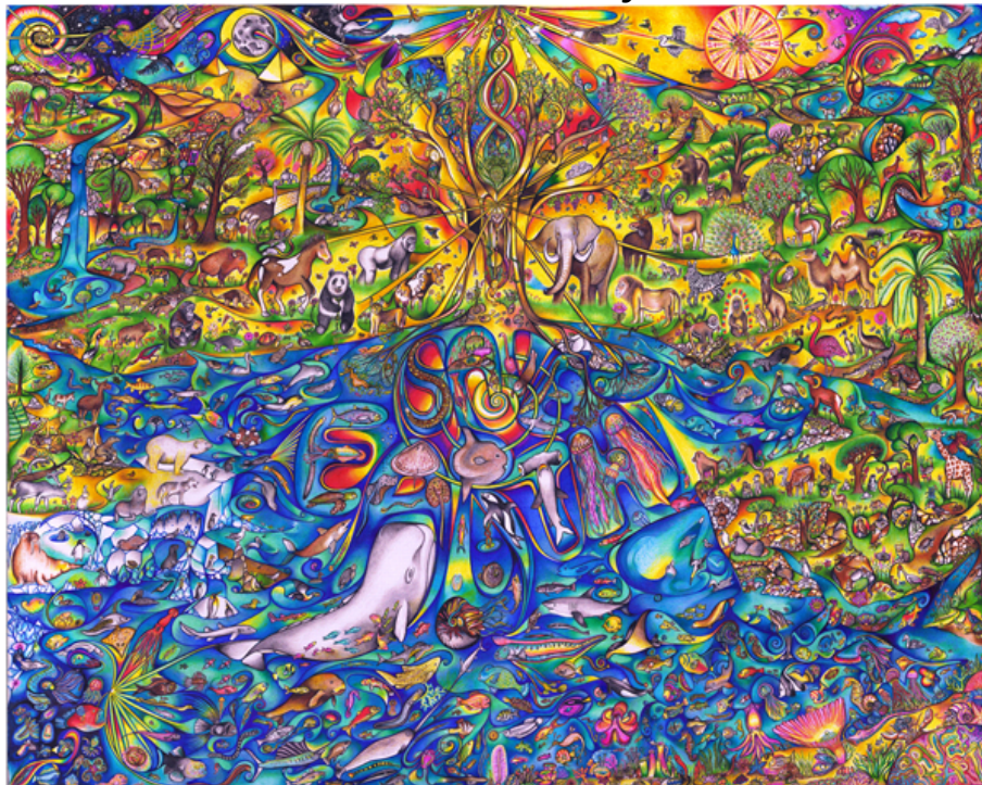
Save eARTh : The Guarding of eARTHly deLights by diNo