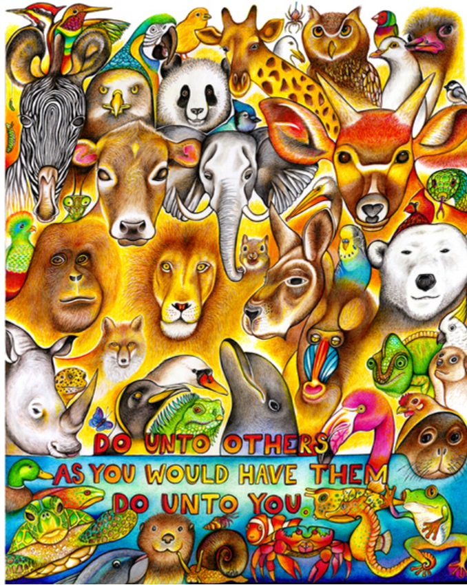
The Golden Rule by diNo