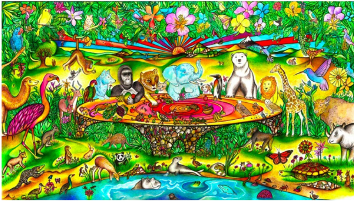
The First Supper by diNo and dART