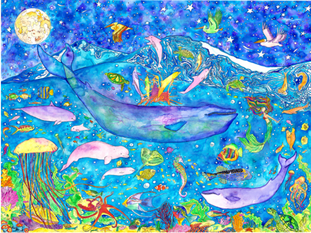
OCEANS by dART